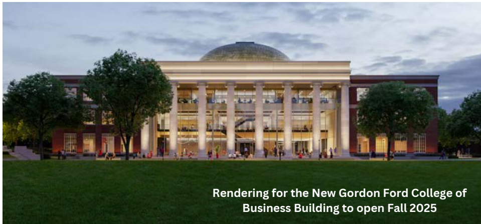
Rendering for the New Gordon Ford College of Business Building to open Fall 2025