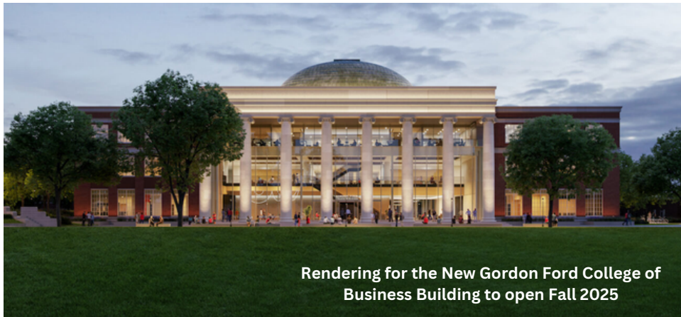
Rendering for the New Gordon Ford College of Business Building to open Fall 2025