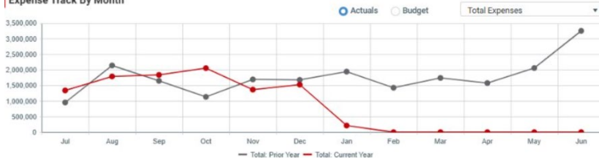
Expense Track By Month